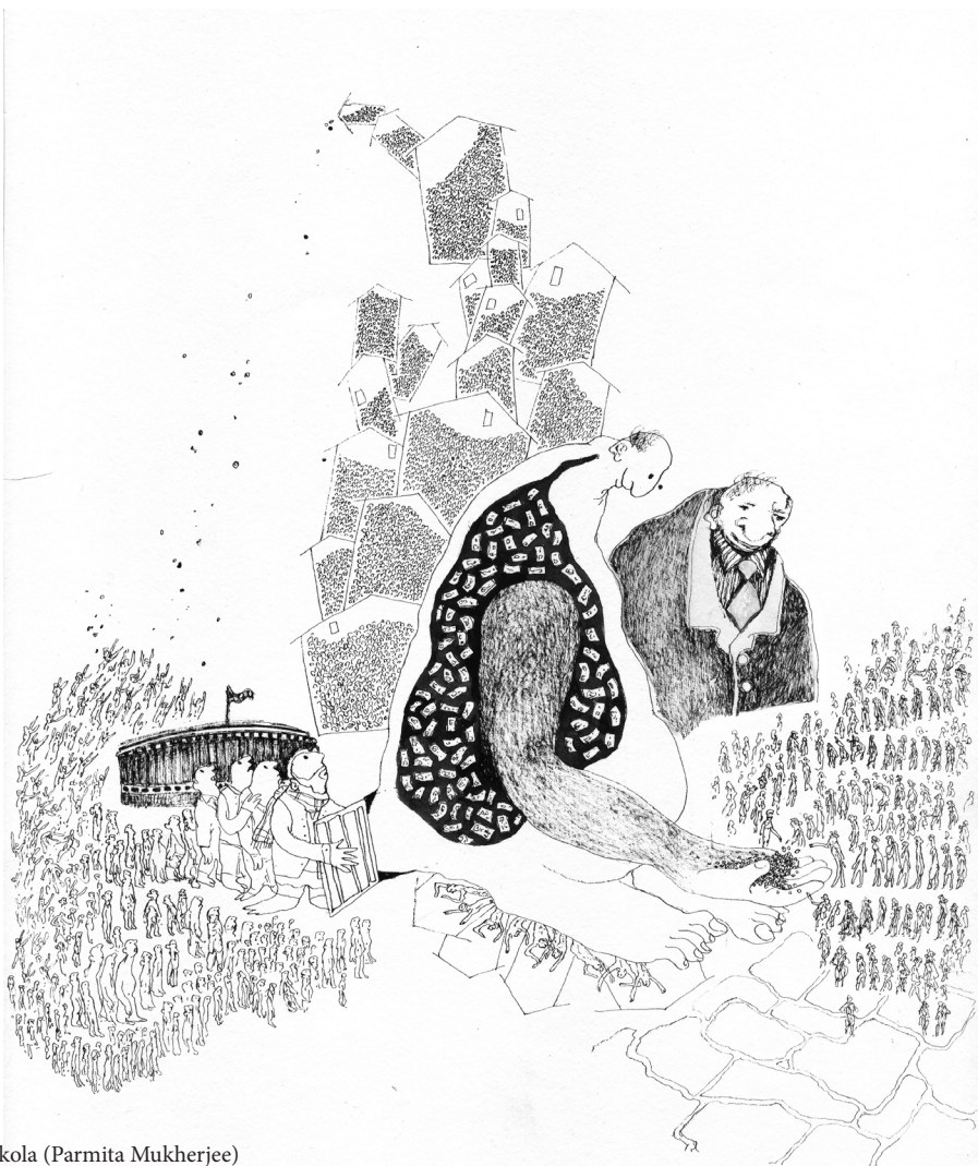
@bokokola (Parmita Mukherjee)